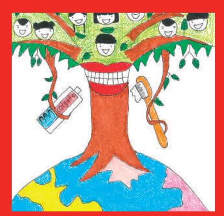
Myanmar 2021 Winner