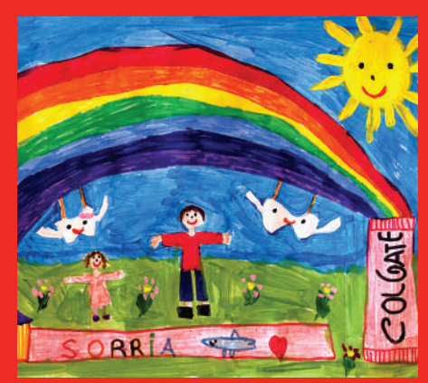
Portugal 2021 Winner