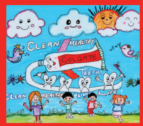
Pakistan 2021 Winner