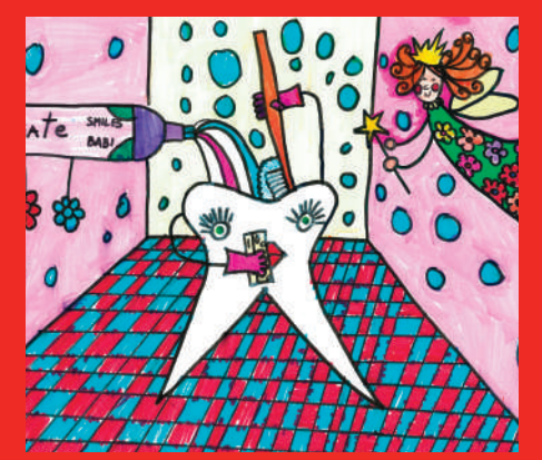
Romania 2021 Winner