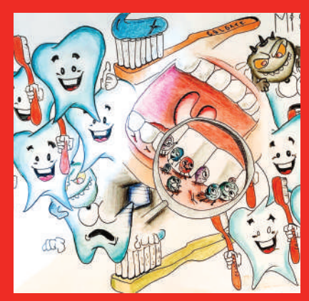
Mexico 2021 Winner