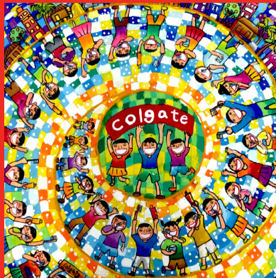
Thailand 2019 Winner