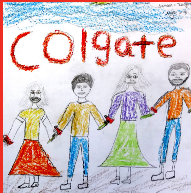
Ethiopia 2019 Winner