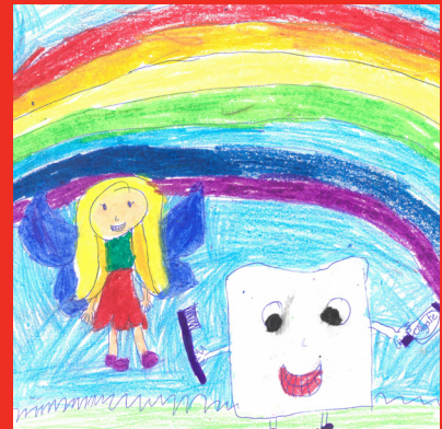
USA 2019 Winner