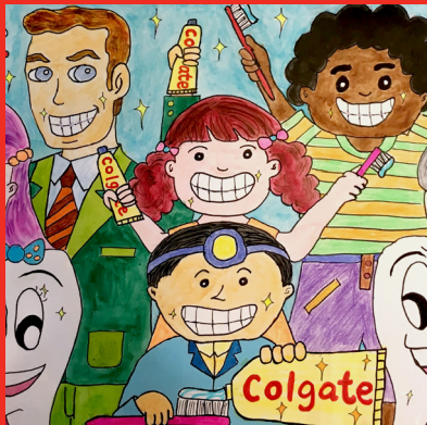
Hong Kong 2019 Winner