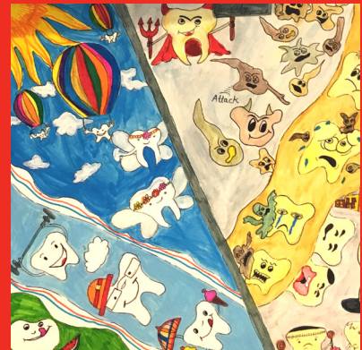
Pakistan 2019 Winner